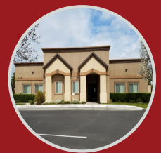
Growing Patch Childcare (biz. + real estate)