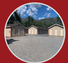
North Fork Mini Storage (biz. + real estate)